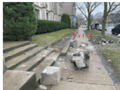
Limestone finials from roof strewn across sidewalk alongside school building.