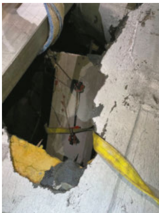
View from roof of limestone stabilized in attic to prevent further damage until it is extracted.

Thus far, we know that large limestone pieces were dislodged by the micro-burst weather event. Some careened off building roofs, others fell directly to the ground or landed on lower roofs where they remain wedged against parapet walls. Unfortunately, several large pieces shattered the church roof and fell into the church. There, they caused additional damage, some of which may be structural. Some pictures are shared with this update.