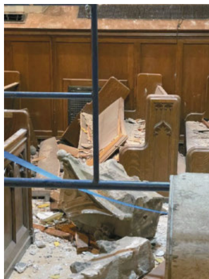
Impact damage to church area where finials landed.